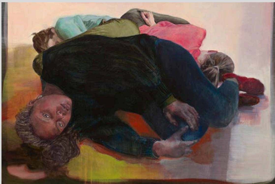
Emma Stroude, Seeds , Oil on canvas, 100cm x 150cm 2025, €5600