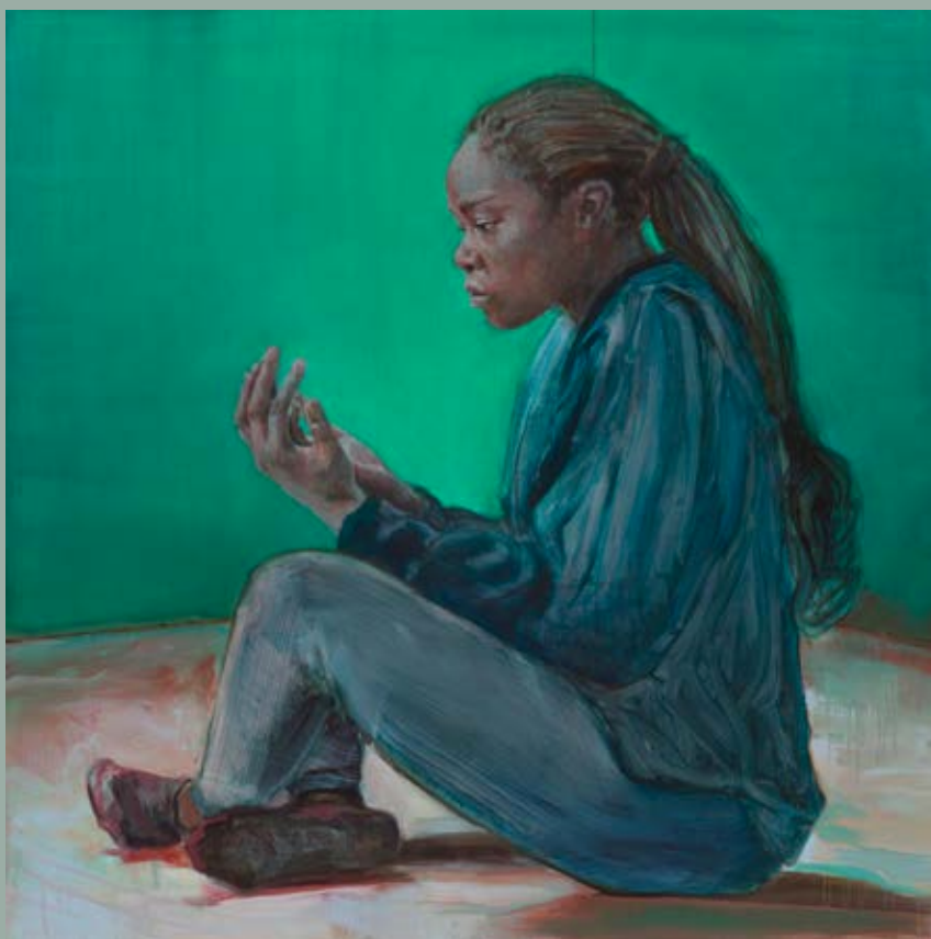
Emma Stroude Ruby Oil on canvas 100cm x 100cm, 2025 €2800