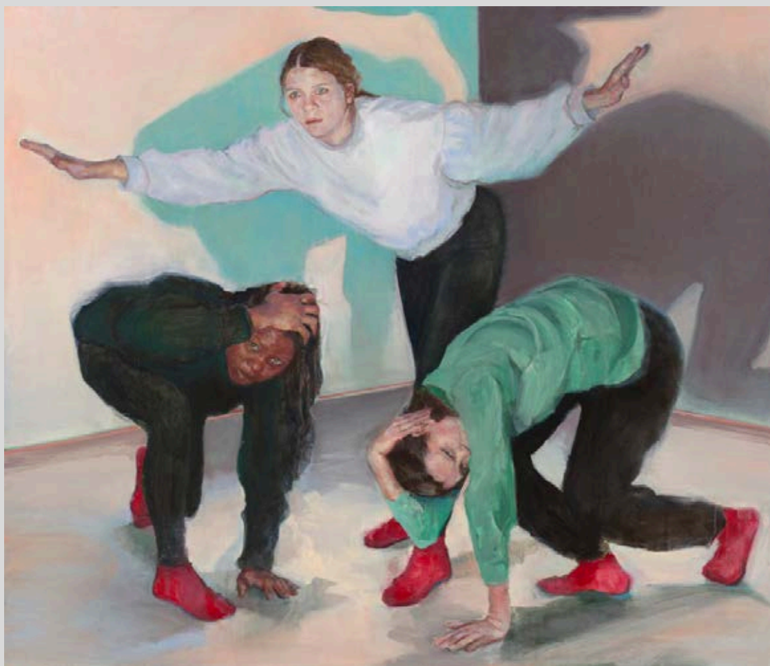
Enough (After Rego), Oil on canvas, 120cm x 140cm, 2025, €5600