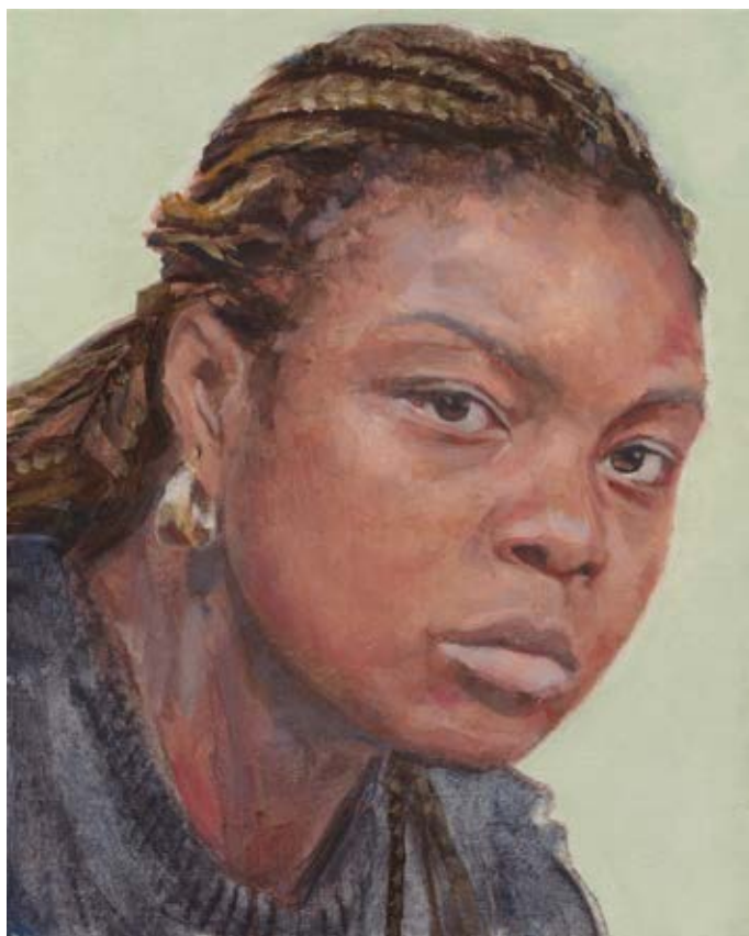
Ruth, Oil on canvas, 25cm x 20cm, 2025 €1100