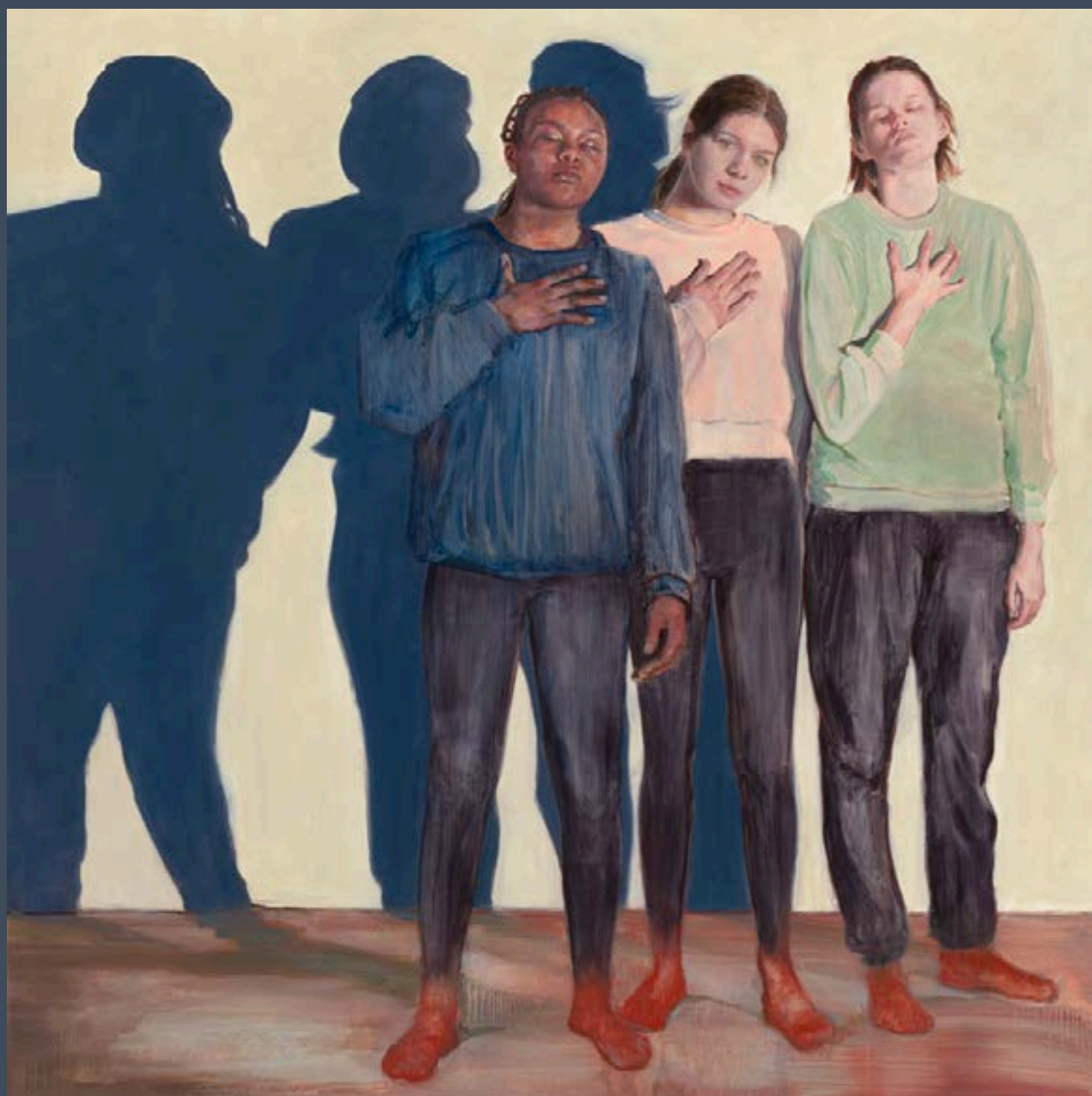
Three Towers. Impenitent., Oil on canvas, 150cm x 150cm, 2025, €7200