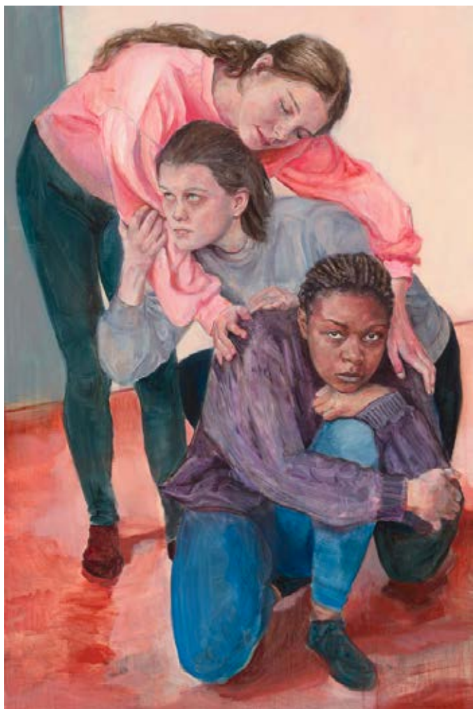
Emma Stroude, Gradual Heat, Oil on canvas, 150cm x 100cm, 2025, €5600