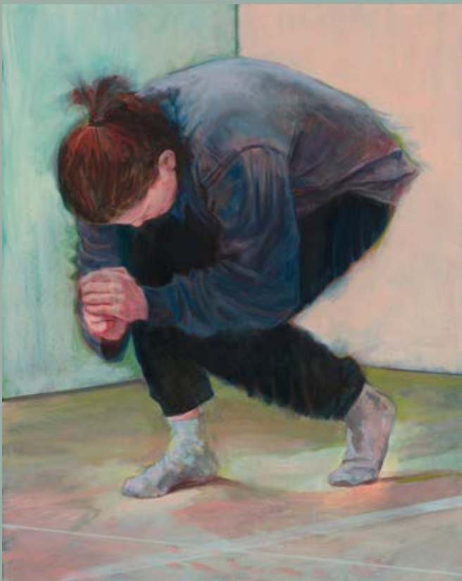
Emma Stroude Petra Oil on canvas 120cm x 100cm 2025 €4,400