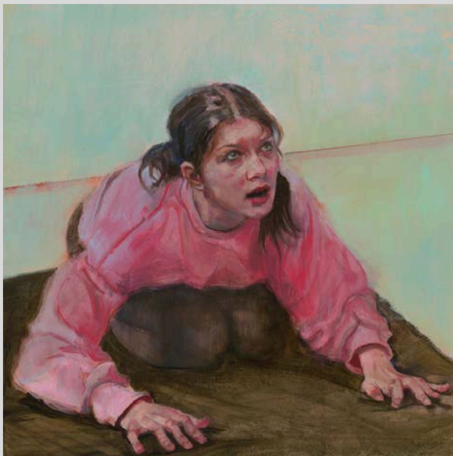
Emma Stroude, Incy Wincy , Oil on canvas, 80cm x 80cm, 2025, €2200