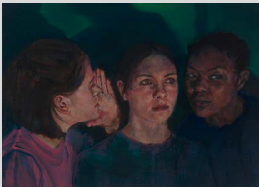
Emma Stroude Whats the Time Ms Woolf Oil on canvas 50cm x 70cm 2025 €1800