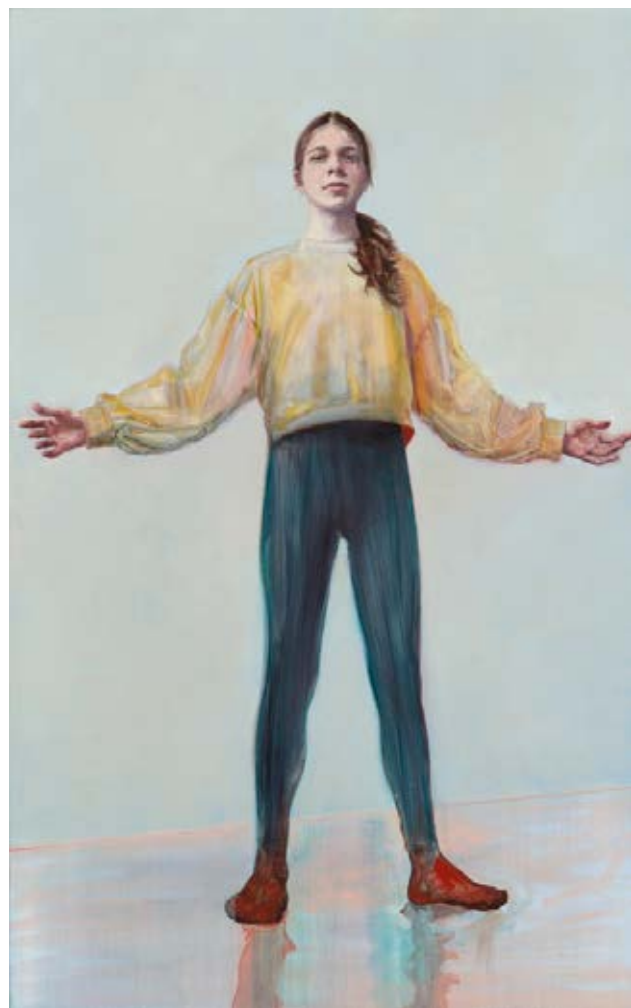
Empty Handed and Armed Oil on canvas, 160cm x 100cm, 2025 €5700