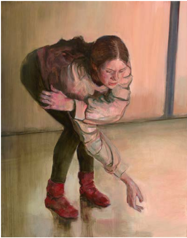
Ridding the Pink Oil on canvas, 120cm x 100cm, 2025 €4400