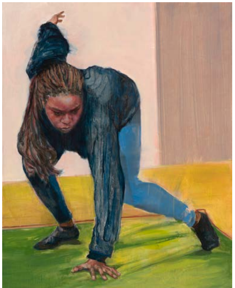
Stronghold, Oil on canvas, 120cm x 100cm, 2025 €4400