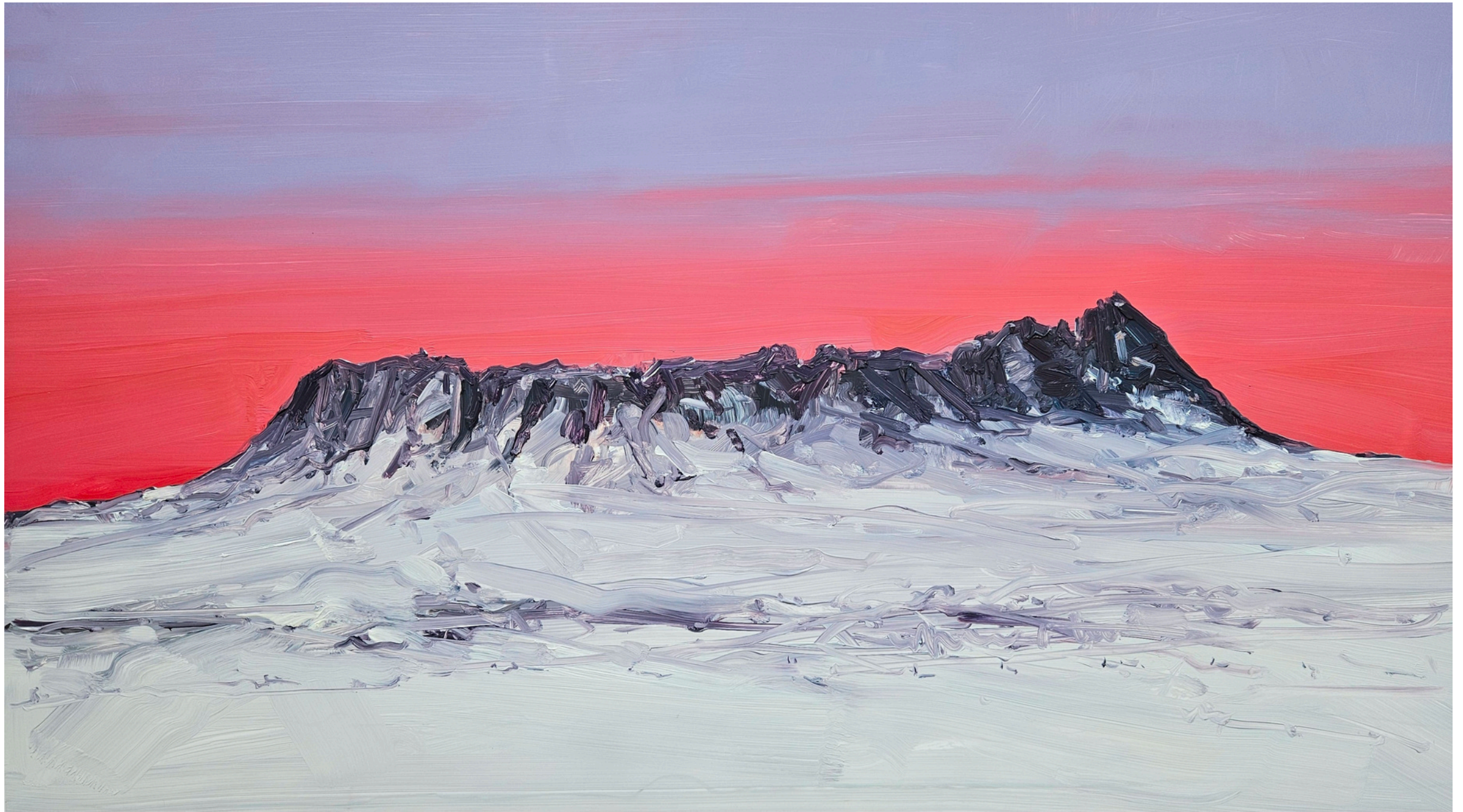
Sunset at Eldborg Scoria Crater, 52 x 91 cm, Oil on Paper (unframed) €1850