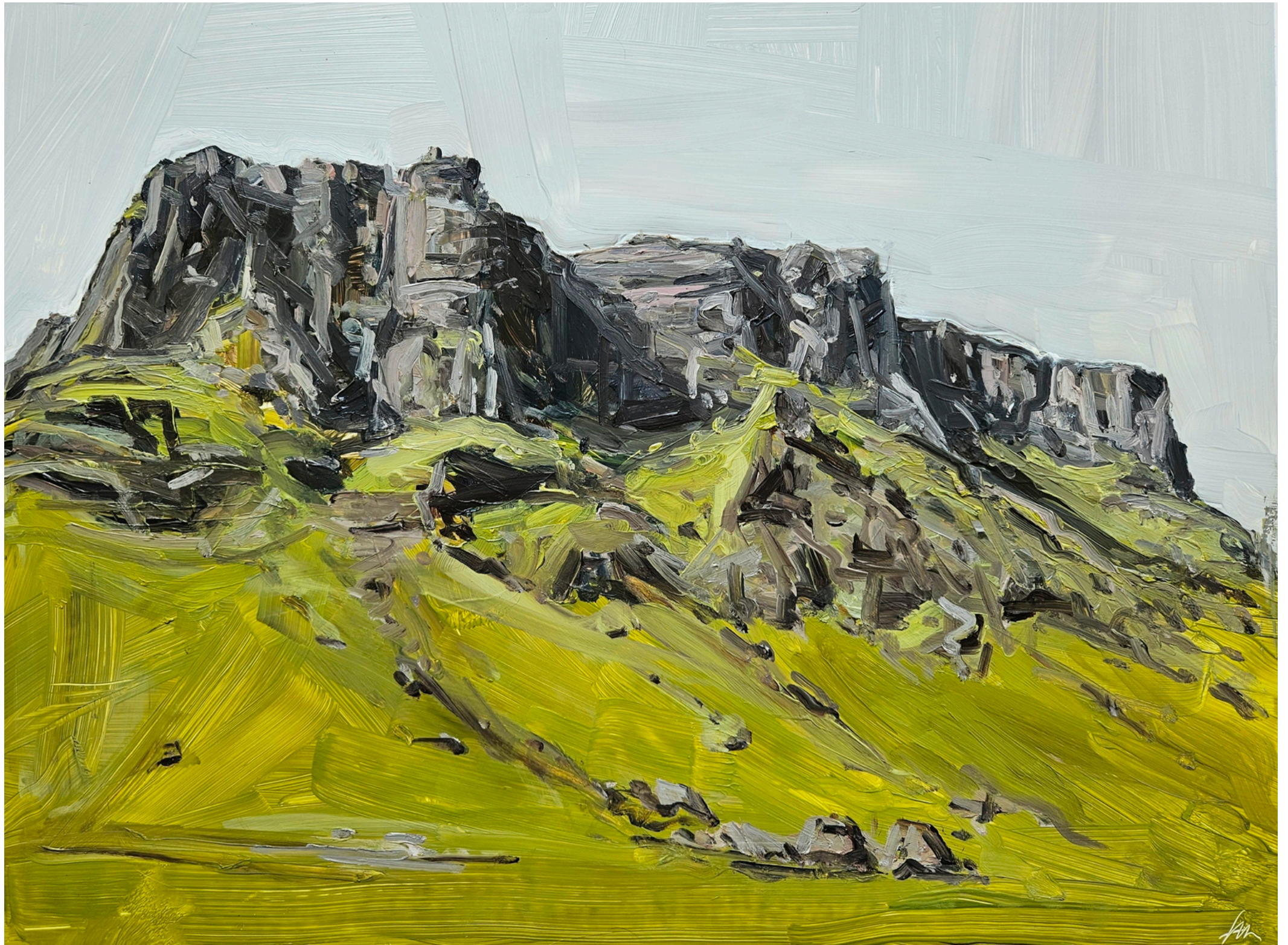
Mt. Pétursey, 46 x 61 cm, Oil on Paper €1450