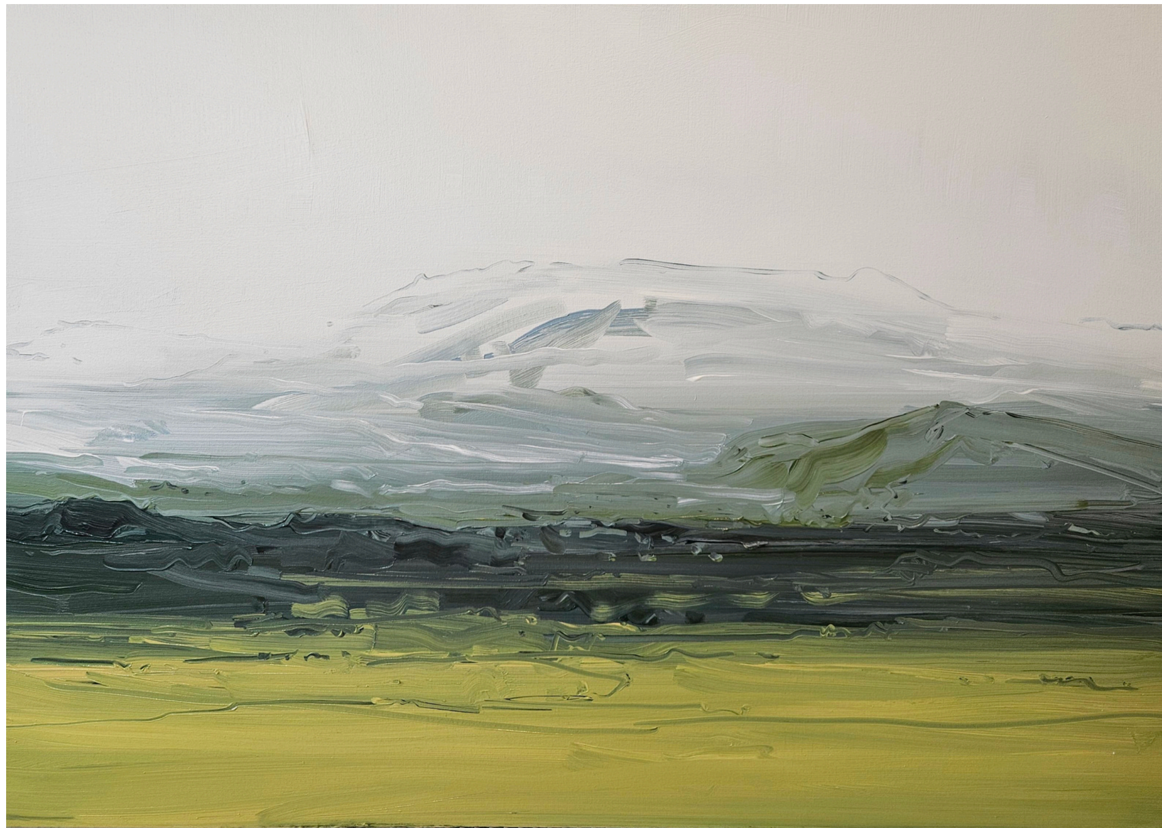
Helka under Clouds, 80 x 100 x 4 cm, Oil on Canvas, €1950.