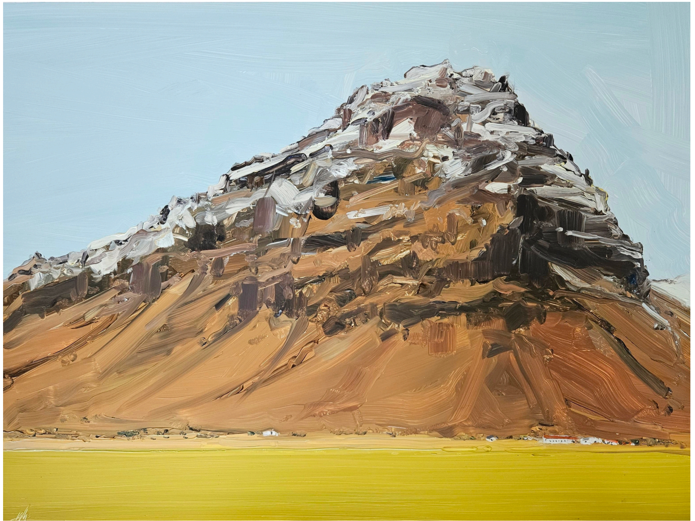
Drangshlíðarfjall Montain, 46 x 61 cm, Oil on Paper, €1450 + framing costs