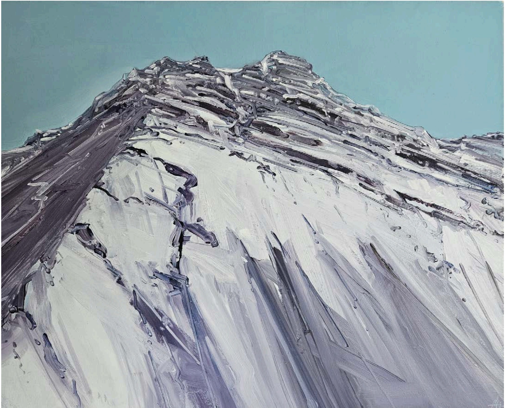
Monument, Mountain Ridge, South Iceland, 80 x 100 x 4 cm, Oil on Canvas, €1950.