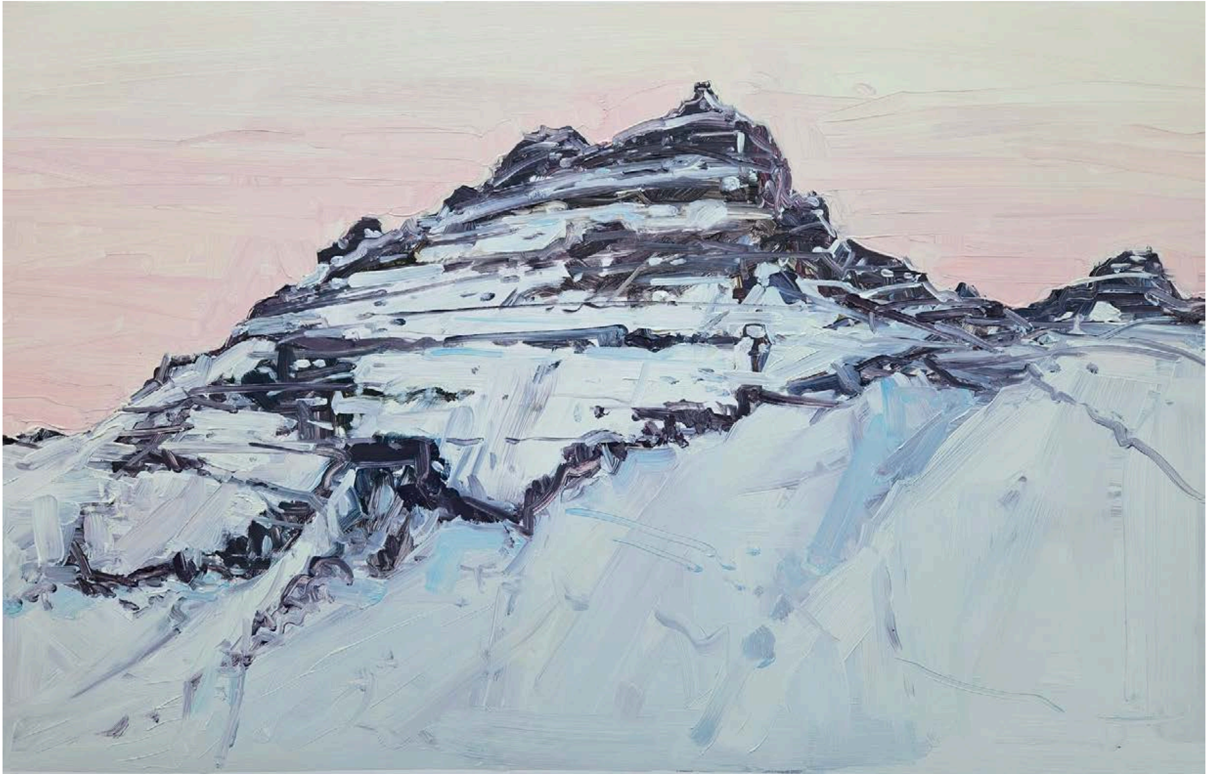
Snjó Mountain, 61 x 96 cm, Oil on Paper, €1950 + framing costs.