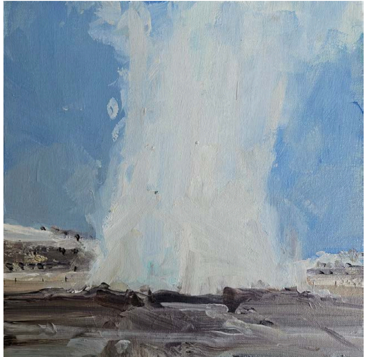
Geyser 2 30 x 30 cm Oil on Board €650