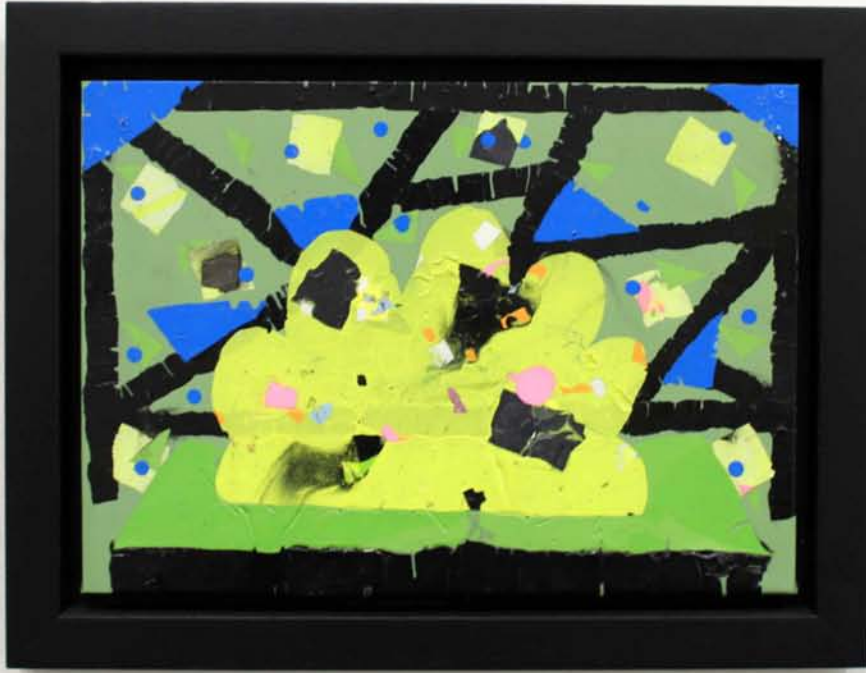
Ciaran Bowen, Mind Map, Acrylic Paint Skin stretched over Board, 25 x 35cm, €750