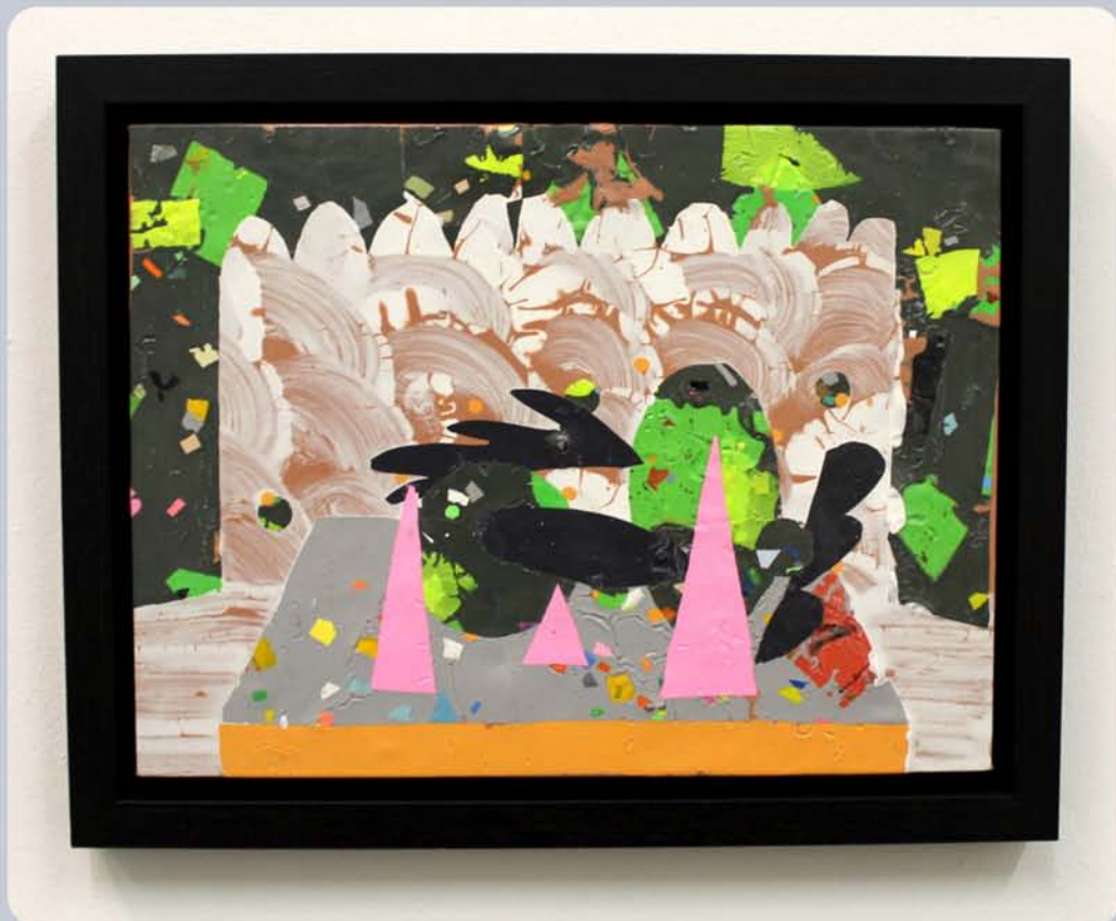
Ciaran Bowen, Dark Paradise, Acrylic Paint Skin stretched over Board, 30 x 40cm, €900