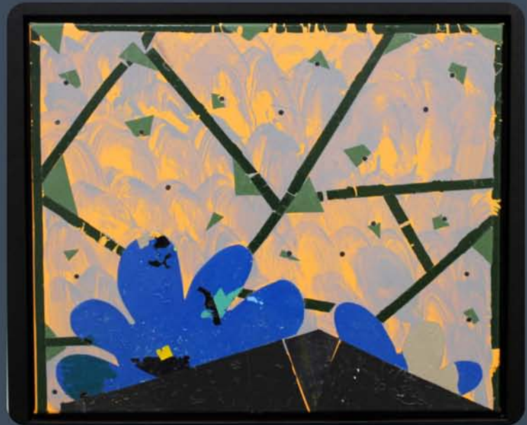
Ciaran Bowen, Other World, Acrylic Paint Skin stretched over Canvas, 50 x 60cm, €1500