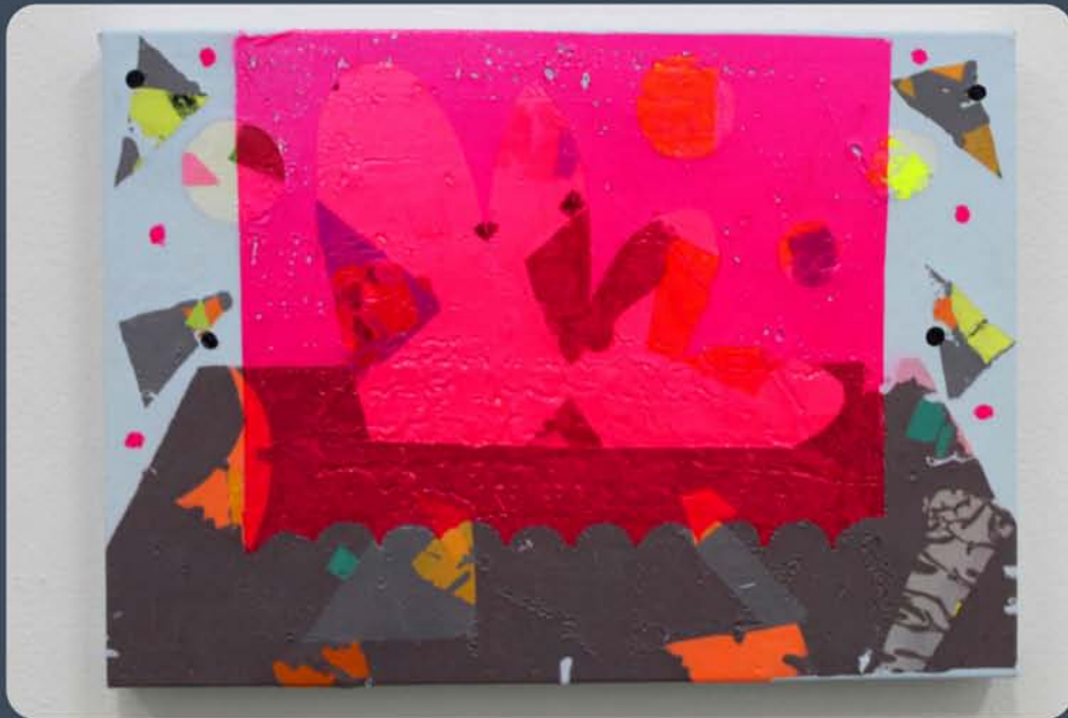
Ciaran Bowen, Curtain Call, Acrylic Paint Skin stretched over Board, 25 x 45cm, €800