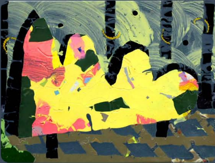
Ciaran Bowen, Prop, Acrylic Paint Skin stretched over Board, 25 x 35cm, €750