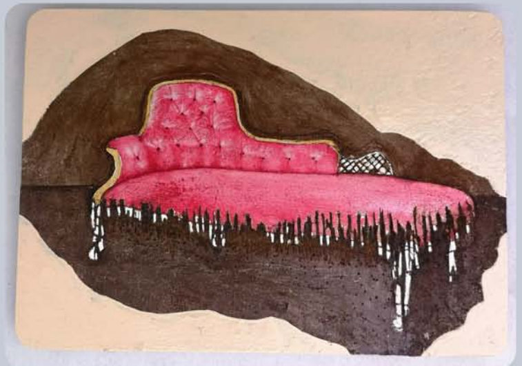
Kate Murphy, Coming Undone Series II, oil on board, 16 x 23cm, 2020, €450