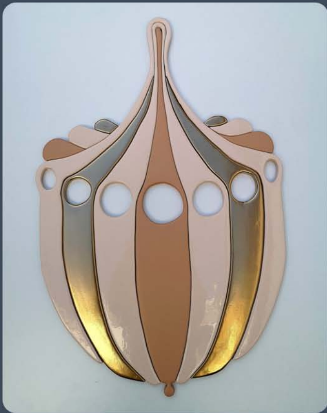
Kate Murphy, Untitled Series III, oil on board, 75 x 53cms, €1,850