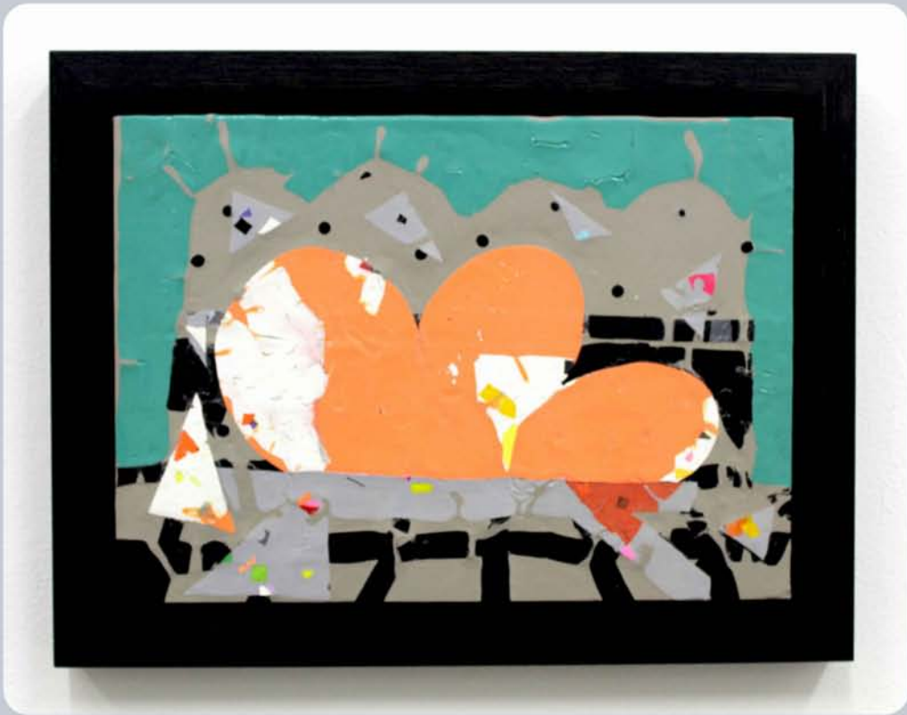
Ciaran Bowen, Formation, Acrylic Paint Skin stretched over Board, 25x35cm, €750