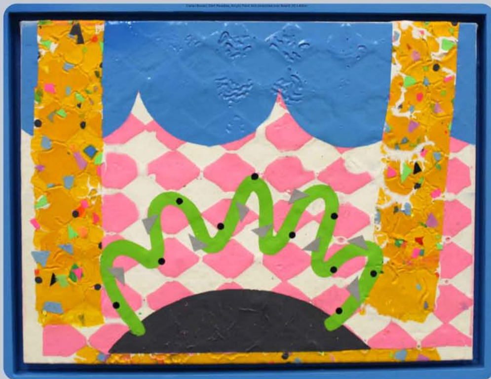
Ciaran Bowen, Theatre II, Acrylic Paint Skin stretched over Board, 30 x 40cm, €800