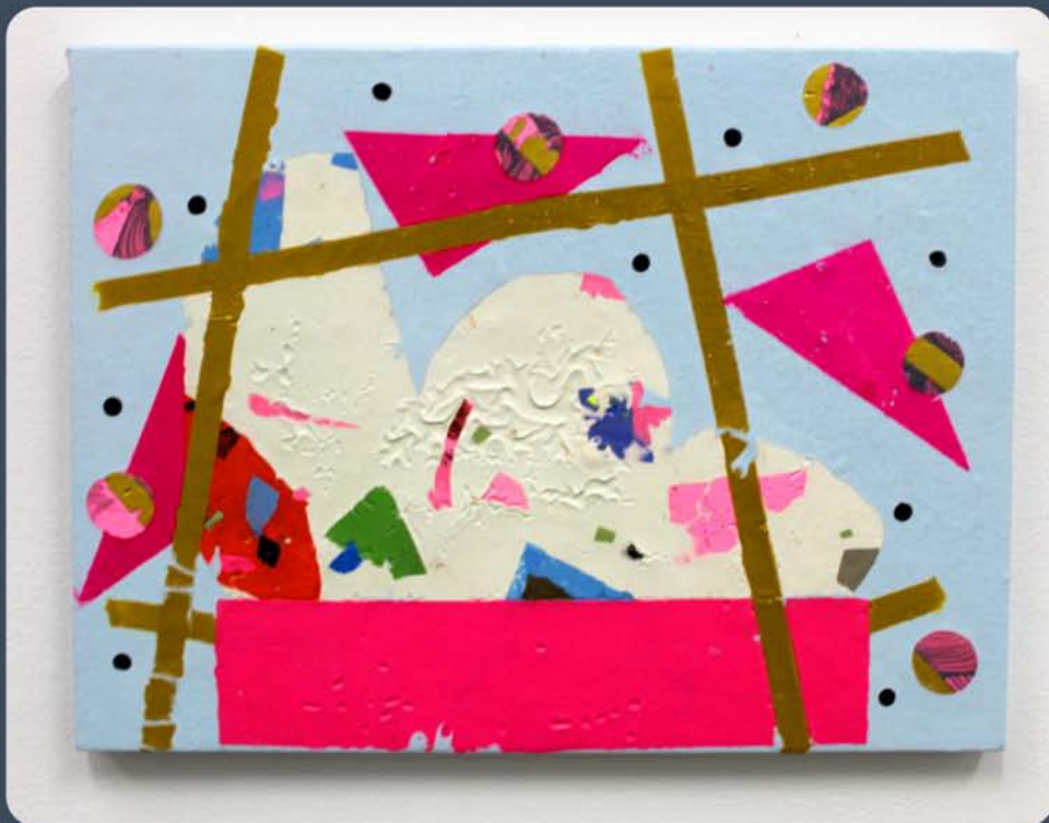
Ciaran Bowen, String Theory, Acrylic Paint Skin stretched over Board, 30 x 40cm, €900