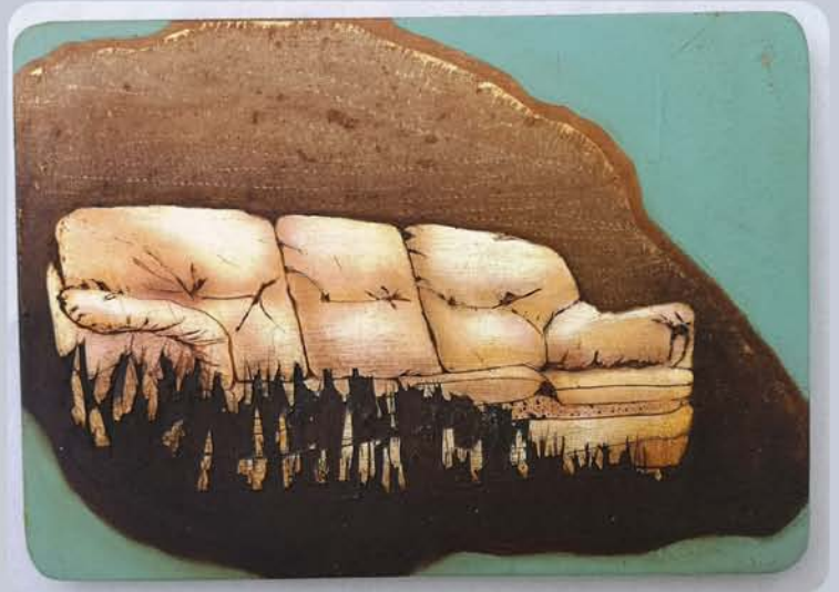
Kate Murphy, Coming Undone Series II, oil on board, 16 x 23cm, 2020, €450