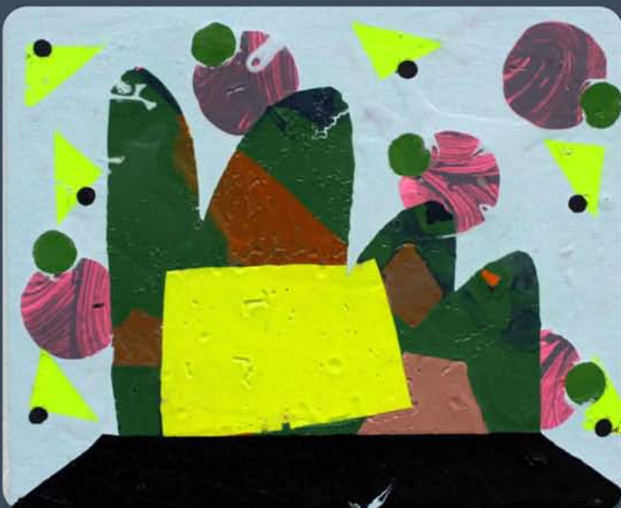
Ciaran Bowen, On top of the Mountain, Acrylic Paint Skin stretched over Board, 20 x 25cm, €400