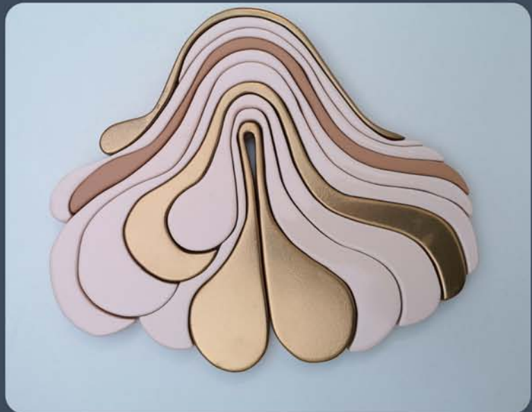
Kate Murphy, Untitled Series I, oil on board, 33x37cms, €800