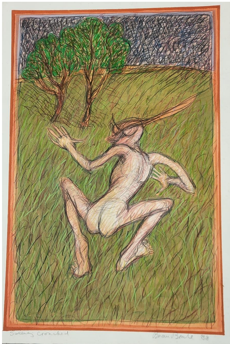
Brian Bourke, Sweeney Crouched, Mixed media on paper, 104cm x 69cm, 1988, €3500