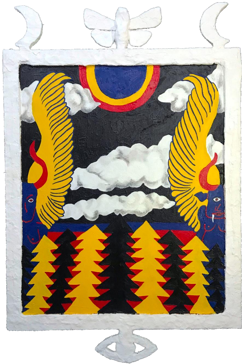
Wild Hunt Peadar Jolliffe-Byrne, Oil on board in artist made frame, 71.5cm x 40.5cm, 2022, €1500