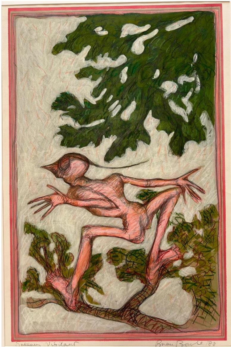
Brian Bourke, Sweeney Vigilant Mixed media on paper, 104cm x 69cm, 1988, €3500