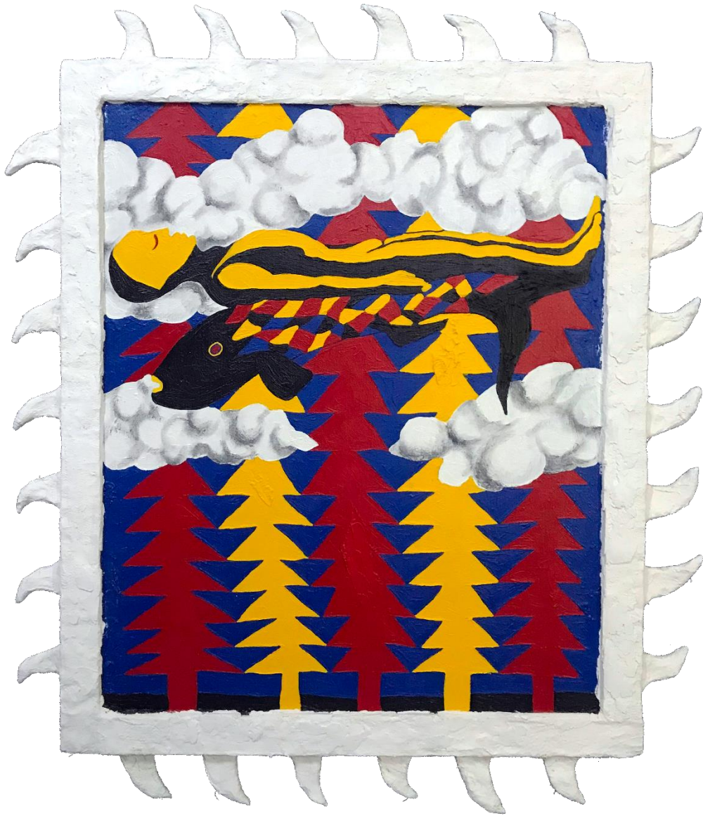
Shavasana Peadar Jolliffe-Byrne, Oil on board in artist made frame, 71.5cm x 40.5cm, 2022, €1500