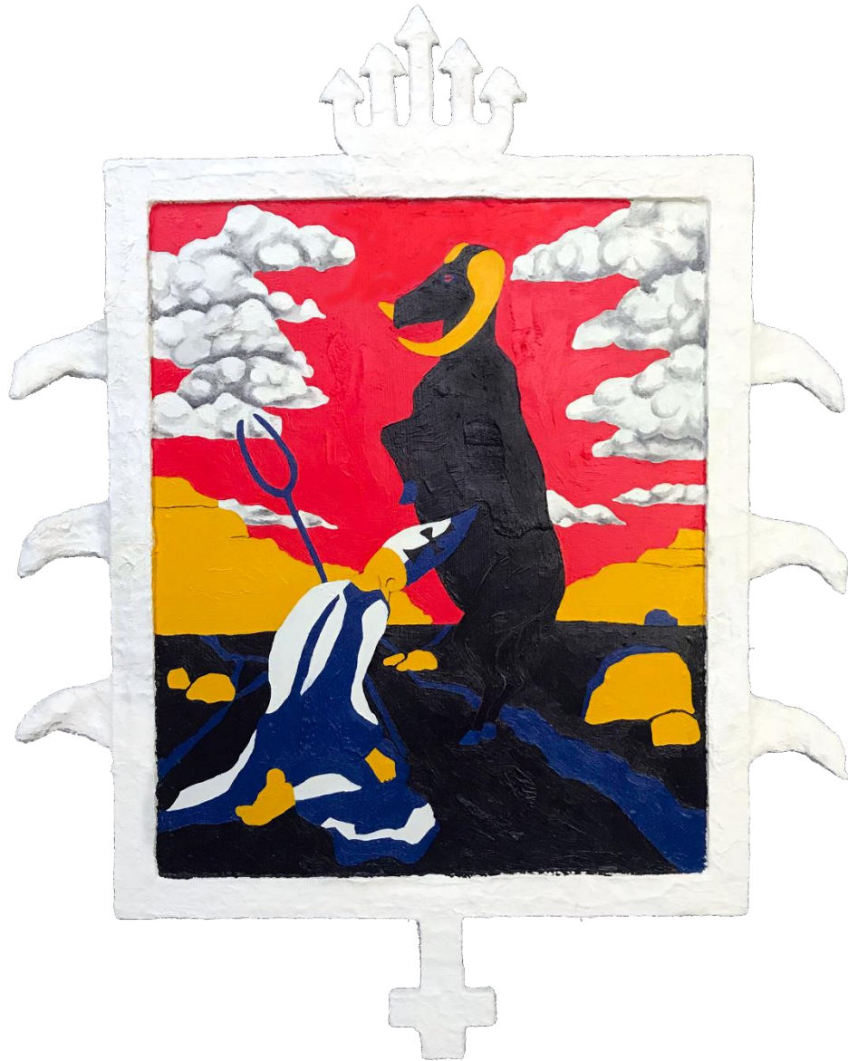
The Defiance of King Puck Peadar Jolliffe-Byrne, Oil on board in artist made frame, 71.5cm x 40.5cm, 2022, €1500