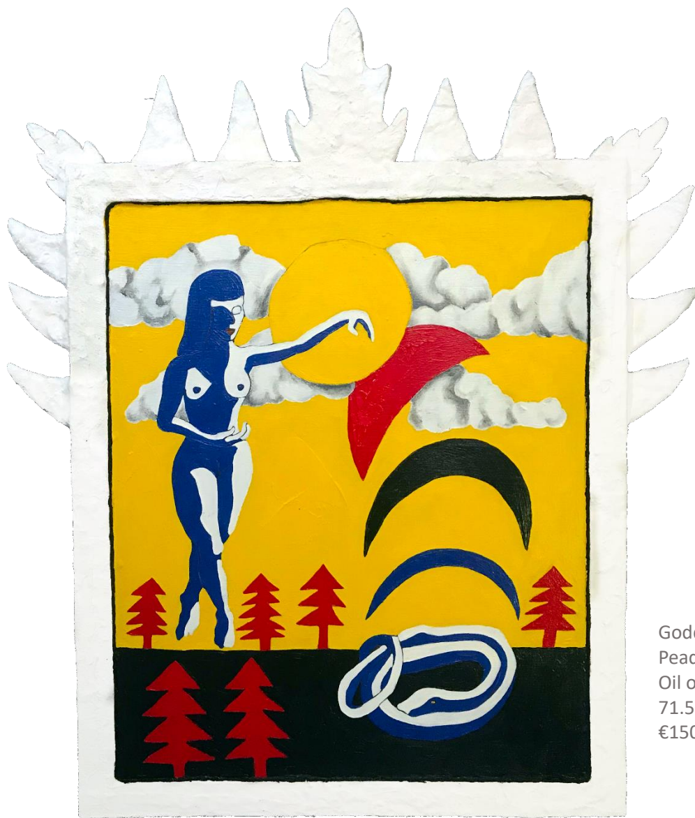
Goddess Peadar Jolliffe-Byrne, Oil on board in artist made frame, 71.5cm x 40.5cm, 2022, €1500