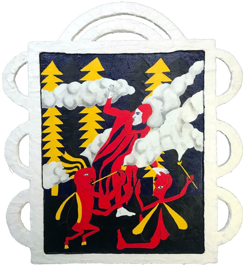
Escape from the Cave Peadar Jolliffe-Byrne, Oil on board in artist made frame, 71.5cm x 40.5cm, 2022, €1500