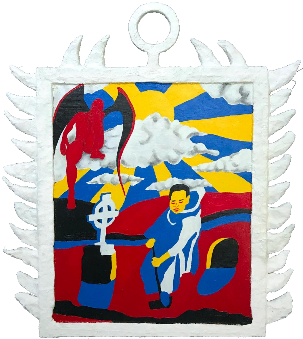
Summer Day Peadar Jolliffe-Byrne, Oil on board in artist made frame, 71.5cm x 40.5cm, 2022, €1500