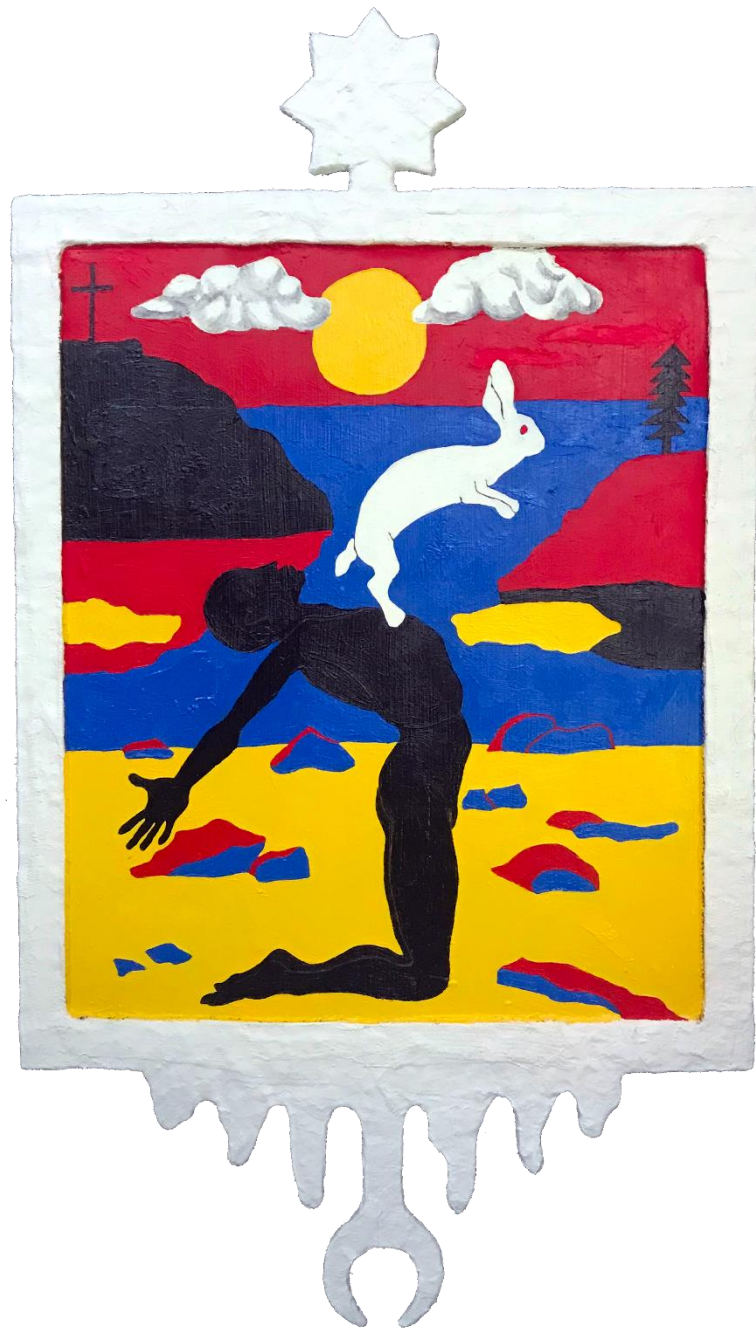
Escape from the Cave Peadar Jolliffe-Byrne, Oil on board in artist made frame, 71.5cm x 40.5cm, 2022, €1500