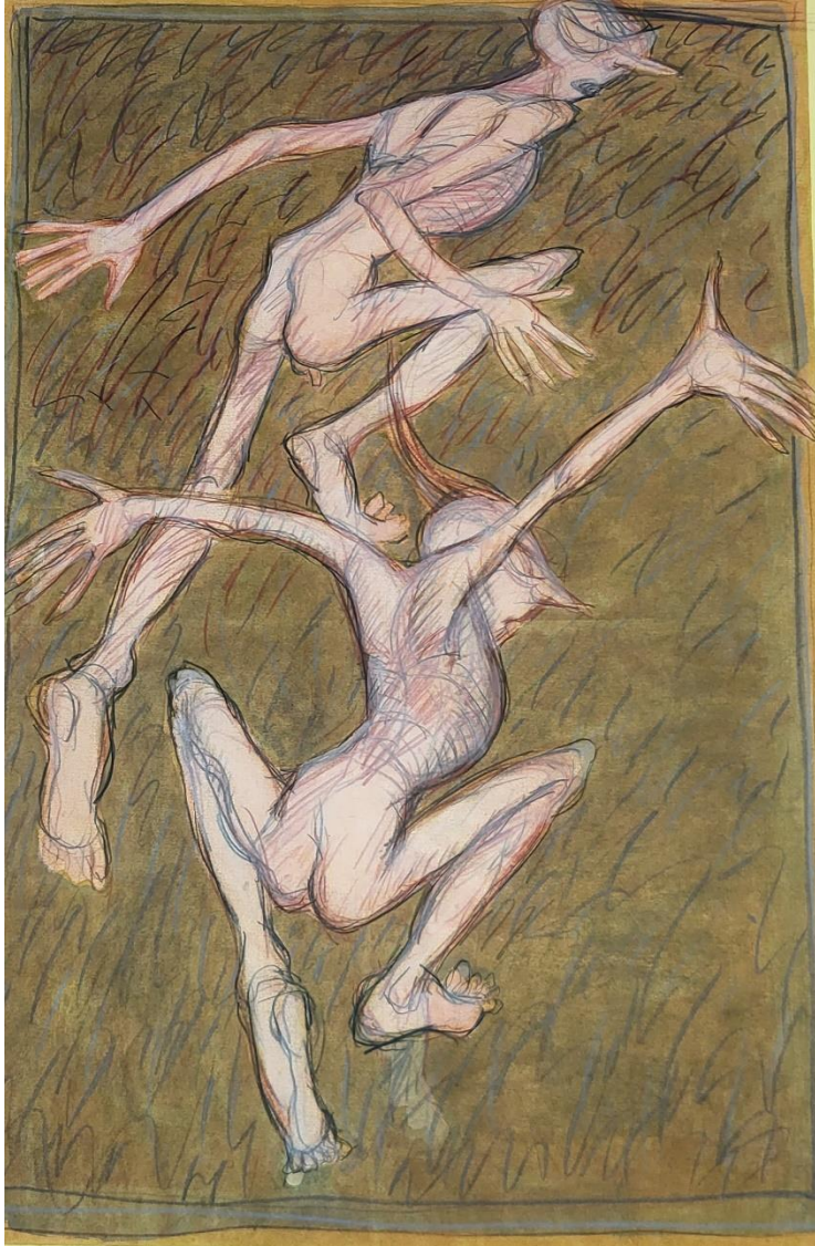
Brian Bourke, Sweeney Twice, Mixed media on paper, 104cm x 69cm, 1988, €3500