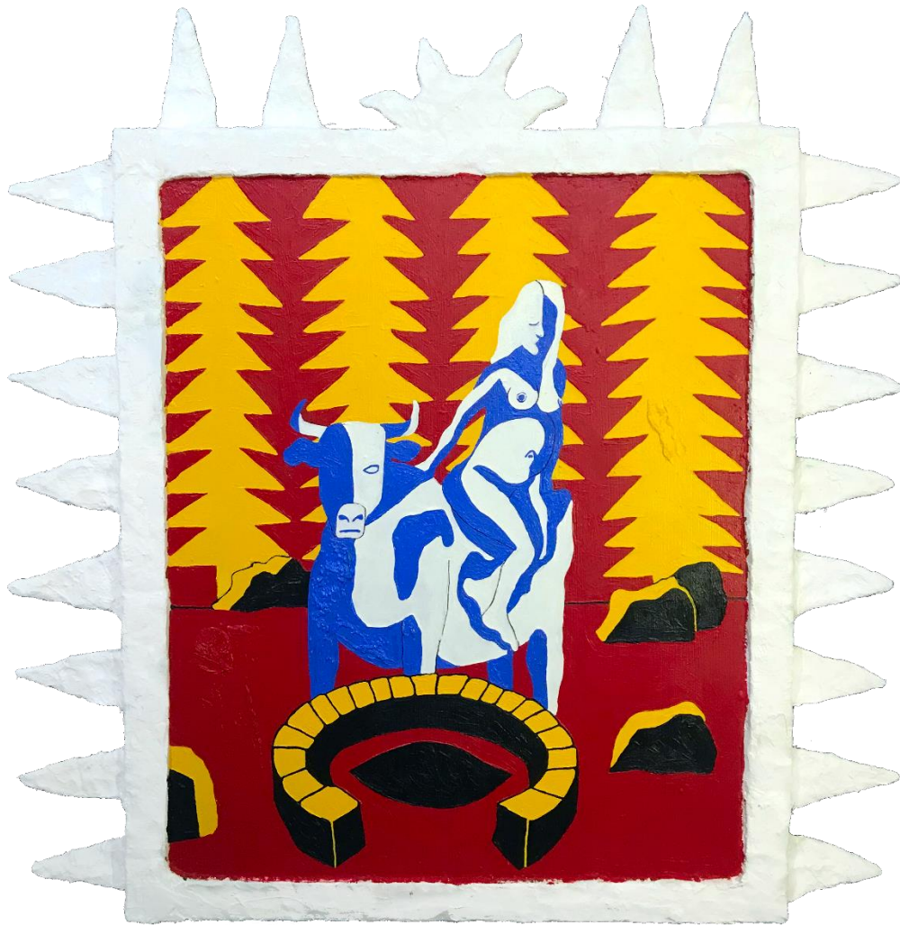
Dawn Peadar Jolliffe-Byrne, Oil on board in artist made frame, 71.5cm x 40.5cm, 2022, €1500